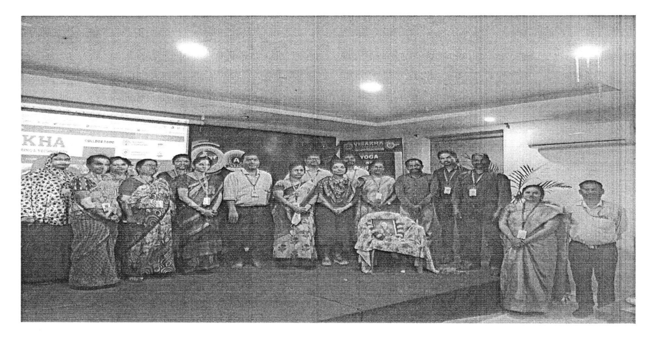
PRINCIPAL VISAKHA INSTITUTE OF ENGINEERING & TECHNOLOGY 57th DfvISION, NARAVA, VISAKHAPATNAM

Thus, the various activities conducted in the college give a boost to the overall personality of students who are transformed into disciplined, well-mannered, technically sound citizens with the required skills and are also ready for serving society as quality engineers.